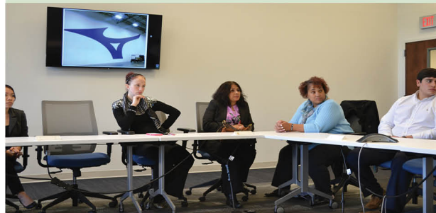
Industry experts discuss the importance of cost accounting with Accounting students.

A Unit of the Technical College System of Georgia www.tcsg.edu