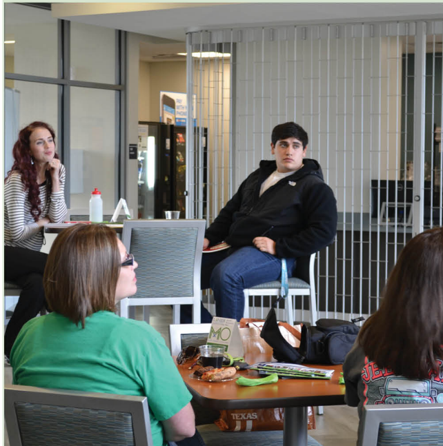
Accounting Club hears motivational speech from industry CFO.