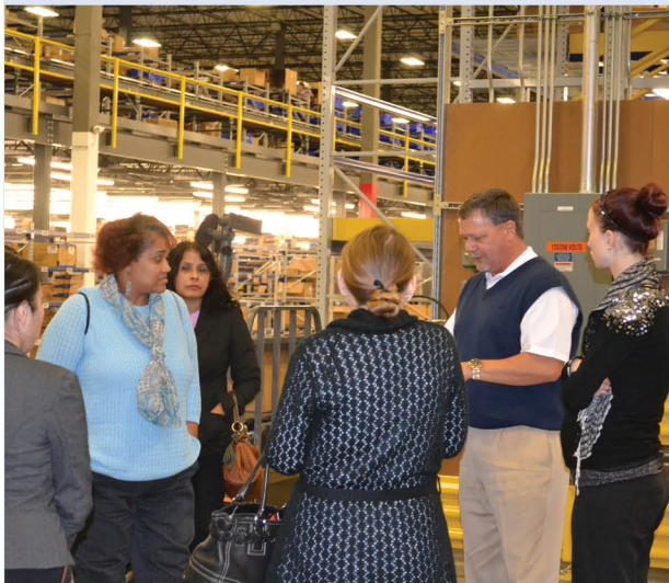
Accounting students study lean management skills on industry tour.

Accountants and bookkeepers are financial record keepers. They update and maintain accounting records, including payroll, individual tax, accounts receivable, accounts payable and financial statements. These workers have a wide range of skills from full-charge bookkeepers, who can maintain an entire company's books, to accounting clerks who handle specific tasks. Accounting positions focus on day to day transactions as well as industry specific financial needs. Excellent computer skills are required to be successful in this career.