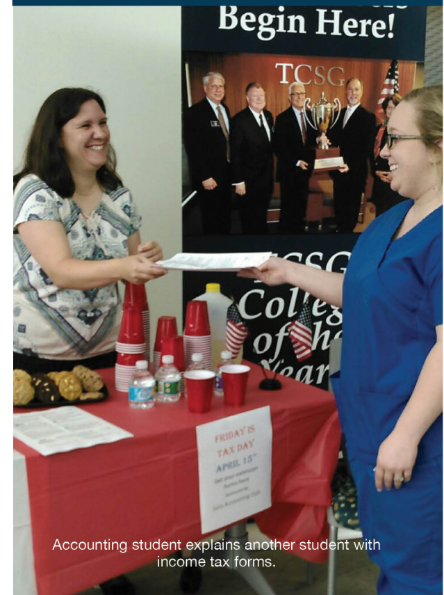
Accounting student explains another student with income tax forms.